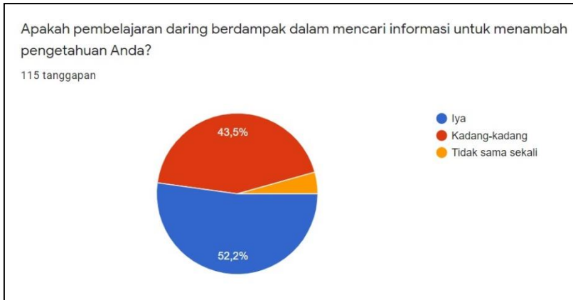
Figure 6. Impact of Online Learning in Finding Information

Figure 7 shows that online learning impacting on the creativity of students of UHN I Gusti Bagus Sugriwa Denpasar. This fact can be seen from the responses of 49 students (42.6%) who stated 'yes', 47 people (40.9%) stated 'sometimes'; and 19 students (16.5%) stated 'no'. The results of the survey based on Figure 7 below shows that online learning carried out by students of UHN I Gusti Bagus Sugriwa Denpasar as part of an effort to prevent the spread of Covid-19 have an impact on students to further develop their creativity, in addition to the important role of lecturers as facilitators in help them in solving the problem of learning, including the provision of teaching materials and worksheets that further encourage the growth of student creativity.