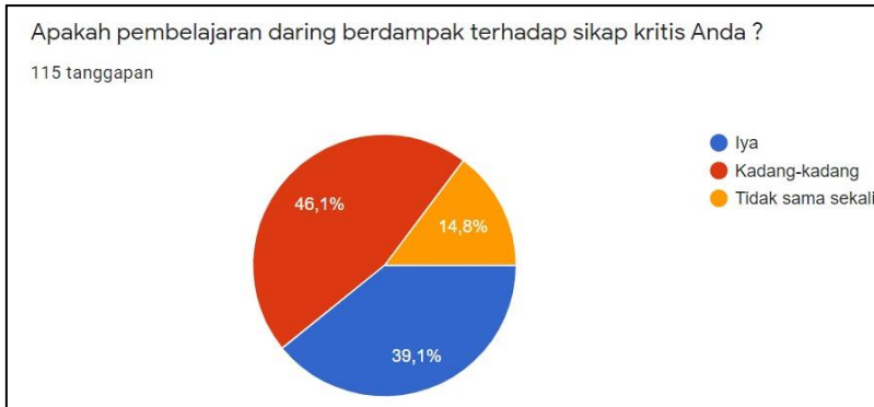
Figure 8. Impact of Online Learning Over Students' Critical Attitudes

There have been several obstacle during the learning process or lecture of students of UHN I Gusti Bagus Sugriwa Denpasar as shown in Figure 9 below. It shows that the perceived obstacles in online lectures during the new normal period include the overburden homework given by lecturers answered by 47% of the respondents or as many as 55 people, limited material from lecturer answered by 20% respondents or as many as 23 people, lectures not punctual reached up to 17,4% or as many as 20 people, monotonous discussion admitted by 13,9% or as many as of 16 people, and lecturers' slow respond in online learning lasted answered by only 1 person or 0.9%.