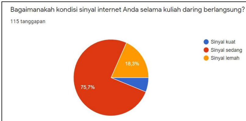
Figure 4. Condition of Internet Signals During Online Lectures

homes, hopefully, will be better in the future so that internet access is faster to support various activities, particularly online learning process activities.