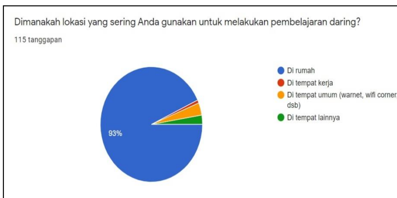
Figure 3. Locations Used for Online Learning

The location of online lecturing that have been responded by 115 students of UHN I Gusti Bagus Sugriwa Denpasar was mostly done at home (93% or 107 respondents / students). The second biggest number, as many as 4 people (3.5%), chose to do online learning in public places such as internet cafe, wifi corner etc. Other students chose in other places as many as 3 people (2.6%), and the rest choose at work as many as 1 person (0.9%) as shown in Figure 3 below. UHN I Gusti Bagus Sugriwa Denpasar has obeyed the government regulations to do more learning activities at home (stay at home) in an effort to prevent the spread of the Covid-19 outbreak.