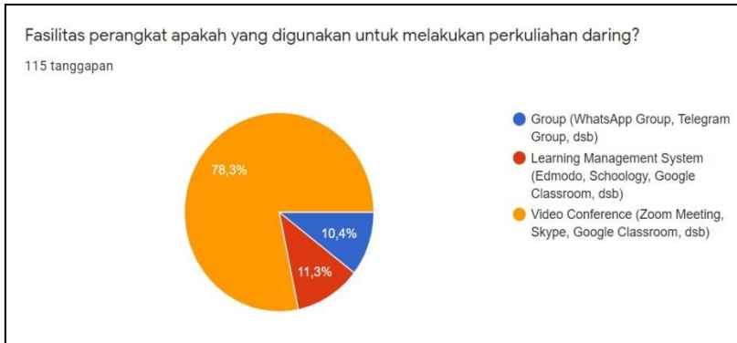
Figure 5. Media Tool Facilities Used for Online Lectures

Figures 6, 7 and 8 show the following impacts as a result of the online lecture process. The survey results in Figure 6, show the fact that 52.2% (60 people) respondents answered the online learning had an impact in finding information to increase knowledge. Fifty students or 43.5% answered 'sometimes' to the question of the impact of online learning in finding information to increase knowledge. The remain 5 students (4.3%) answered that there was no perceived impact in online learning to seek information to increase knowledge. Based on the results of the survey proves that online learning so far conducted by UHN I Gusti Bagus Sugriwa Denpasar as part of an effort to prevent the spread of Covid-19 has a significant impact on students so that they are accustomed to seeking wider information through digital use. Online learning like this is a great opportunity for the improvement of the ability of students to explore the widest possible information through the digital world. This is because students carry out learning not only limited face-to-face in the classroom but the range of learning can be accessed more broadly in digital-based learning. This provides opportunities for students to always search for information through digital while learning.