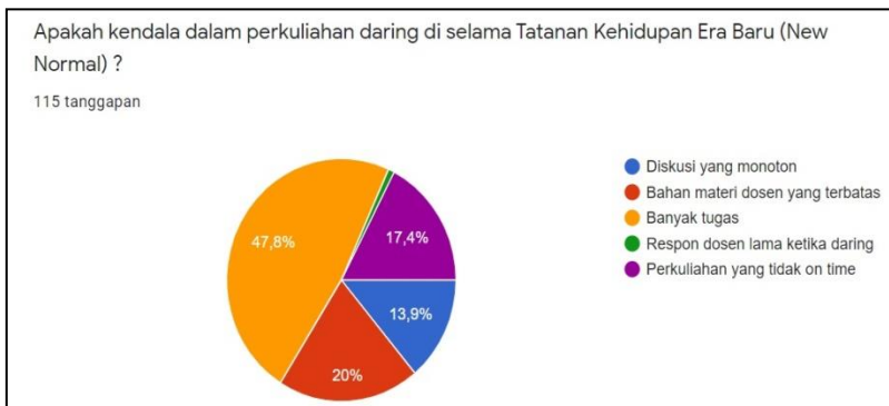
Figure 9. Online Course Constraints During New Normal

There have been several obstacle during the learning process or lecture of students of UHN I Gusti Bagus Sugriwa Denpasar as shown in Figure 9 below. It shows that the perceived obstacles in online lectures during the new normal period include the overburden homework given by lecturers answered by 47% of the respondents or as many as 55 people, limited material from lecturer answered by 20% respondents or as many as 23 people, lectures not punctual reached up to 17,4% or as many as 20 people, monotonous discussion admitted by 13,9% or as many as of 16 people, and lecturers' slow respond in online learning lasted answered by only 1 person or 0.9%.