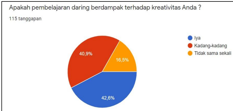
Figure 7. Impact of Online Learning on Students' Creativity

The survey results in Figure 8 on the impact of online learning on students' critical attitudes shows that 46.1% or as many as 53 students answered 'sometimes', 39.1% or as many as 45 students answered 'yes'; and 14.8% as many as 17 students answered 'no'. The results of the Figure 8 survey are very interesting to researchers, because online learning that has been conducted by UHN I Gusti Bagus Sugriwa Denpasar as part of an effort to prevent the spread of Covid-19, apparently has quite an impact on students to foster a critical attitude. With various forms of discussion conducted by lecturers in online learning, there is a great opportunity for students to interact massively with each other. Based on these data, it turns out that online learning does not limit student creativity. This will provide the broadest opportunity for students to explore and develop their critical attitude.