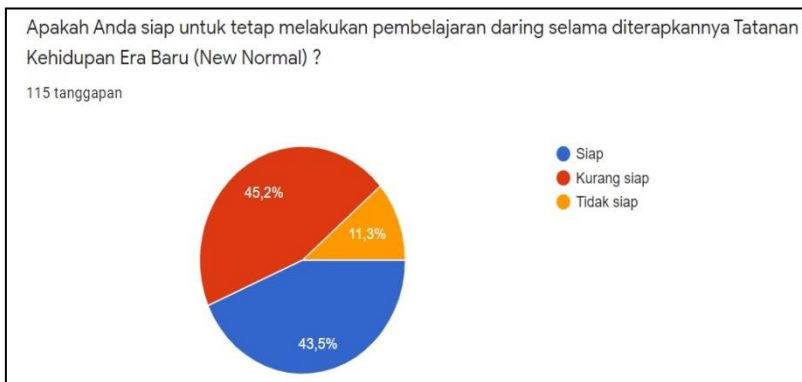
Figure 10. Readiness to Do Online Learning During New Normal

The new policy issued by the government during the new normal obtained several different responses to online lecture activities. The Figure 10 below shows that there is a transition phase of students' and lecturers' readiness in conducting online learning during the new normal era. There are 52 students or 45.2% of the total respondents stated that they were not ready to carry out online learning during the implementation of new normal era. Students who said ready for online learning reach out 43,5% or as many as 50 people and 11,3% or as many as 13 students stated that they were not ready to do online learning during the implementation of new normal. The data shows that there was a process of transition of both lecturers and students to be accustomed to participating in the media learning process or distance learning. It was felt that there was loss of role in online learning process including the role of communicator or communicant and also learning material as messages in the communication process. Theoretically, the communication process can take place only if there are at least five elements of communication available namely communicator, communicant, message, media and effects.