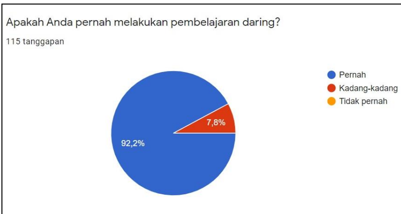
Figure 2. Online Learning

The experience of attending lectures or online learning from 115 UHN student respondents I Gusti Bagus Sugriwa Denpasar stated that they had done online learning as much as 92.2% (106 respondents / students), while 9 students stated that sometimes they did online learning (7.8% ) as shown in the following figure 2.